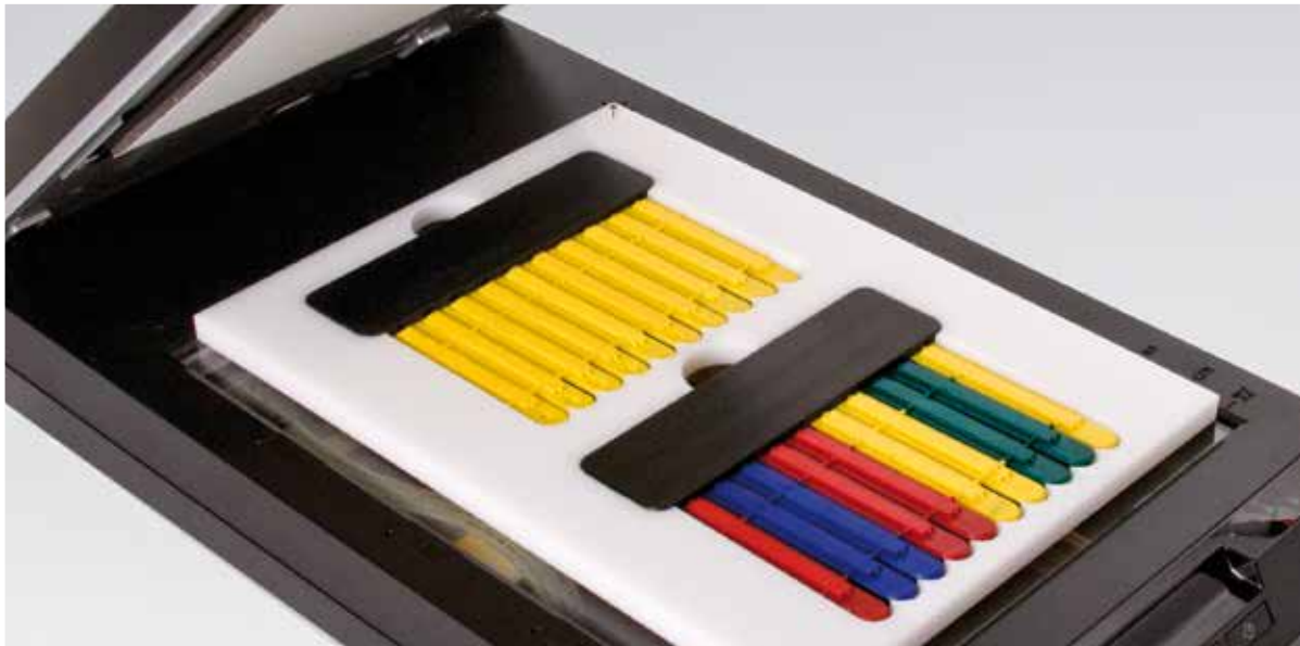
Picture 2 3D Flatbed Scanner and RIDA qLine® Scanner Template (Art. No. ZG1107)