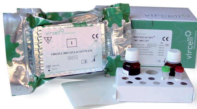
Ref. BRUCAPT 96/24 tests