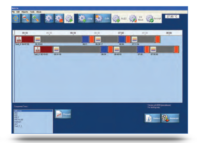
Once you begin running your assay, the timeline and simulator show you exactly where you are in the process and how much time you have left.